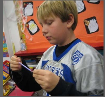
GRADE 3 - Making Rosaries