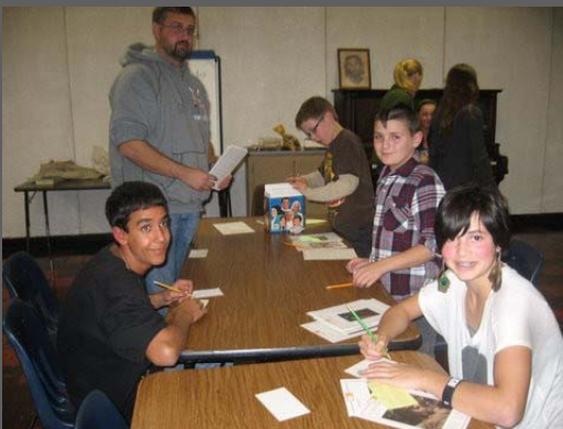
THE EDGE PROGRAM INTEGRATES GRADES 6, 7 & 8